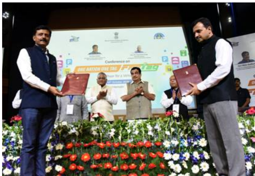
Exchange of MoU documents between IHMCL and GSTN in the presence of Union Minister for Road Transport & Highways and Micro, Small and Medium Enterprises Shri Nitin Gadkari, MoS for Road Transport and Highways Gen. (Retd.) V.K Singh during a conference on 'One Nation One Tag – FASTag' in New Delhi today.

IHMCL and NHAI have developed the My FASTag mobile App to provide a single one-stop solution to FASTag customers. The App helps linking of bank neutral FASTag to bank account of customer's choice. An NHAI Prepaid Wallet was also launched today, giving customers the choice of not linking their FASTag to their bank accounts. Other features of the App include UPI recharge of bank specific FASTag – More than 80% of FASTag issued can be recharged with this facility, single portal for customer login page for issuer banks, Search for nearby Point-of-Sale location by various banks and IHMCL, List of Operational Toll Plazas under NETC programme, and Customer Support Toll-Free numbers.