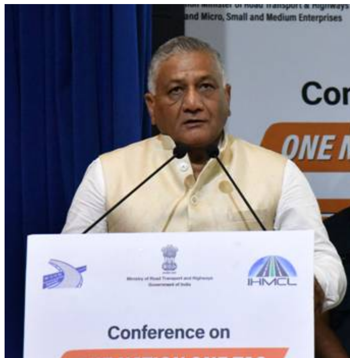
Minister of State for Road Transport and Highways Gen. (Retd.) V.K Singh speaking at the conference on 'One Nation One Tag – FASTag' in New Delhi today.

At present, National Payments Corporation of India (NPCI) is functioning as the Central Clearing House and 23 Public and Private sector banks are issuing FASTag. A cashback of 2.5% is being offered for the FY 2019-20 in order to incentivize road users for usage of FASTag. FASTag is acceptable across over 490 National Highways toll plazas and selected 39+ State highways toll plazas. More than 6 Million FASTag were issued till last month, with overall cumulative ETC collection of over Rs 12,850 Crore since inception. The total cumulative number of successful ETC transactions carried out is over 5540.67 lakhs as in September 2019.